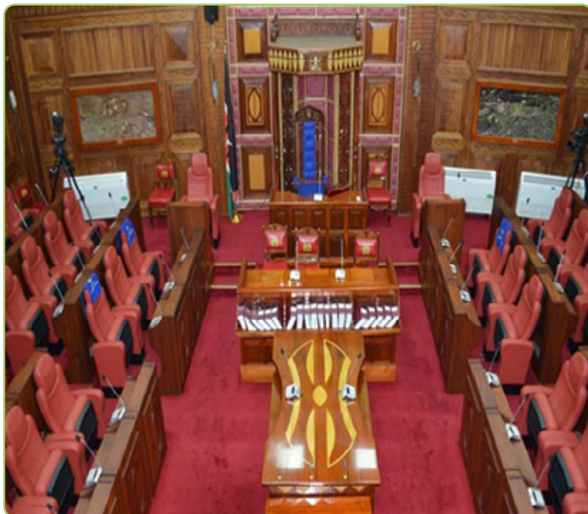
The Senate Chamber