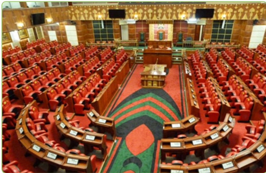
The chamber of National Assembly