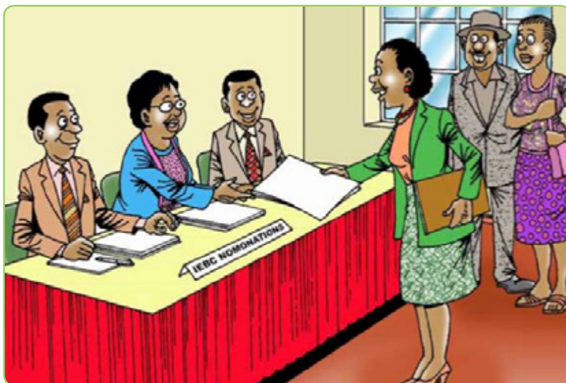
Officers verifying nomination requirements