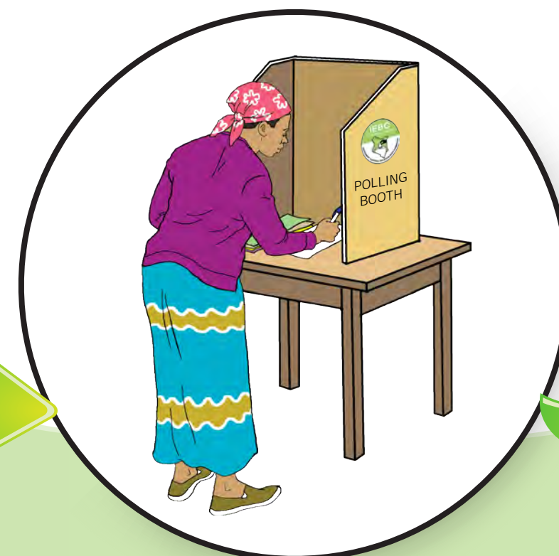
4 Voter marks the Ballot Papers secretly