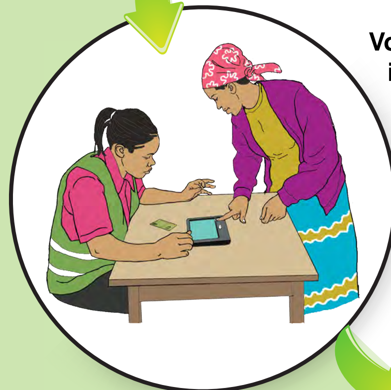
2 Voter's information is verified in the KIEMS Kit