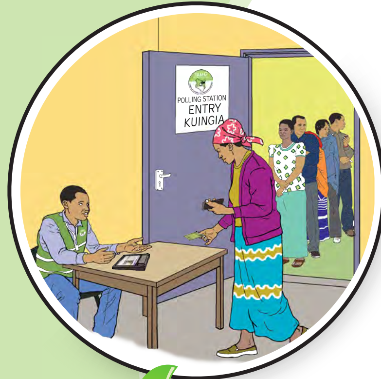
1 Voter enters Polling Station with ID/Passport