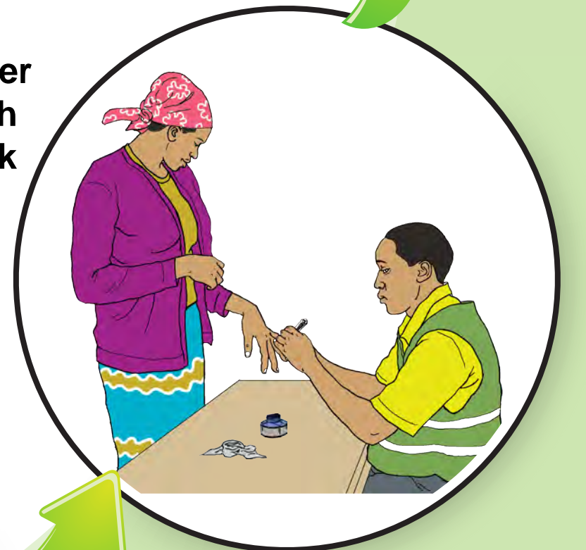
6 Voter's finger marked with indelible ink