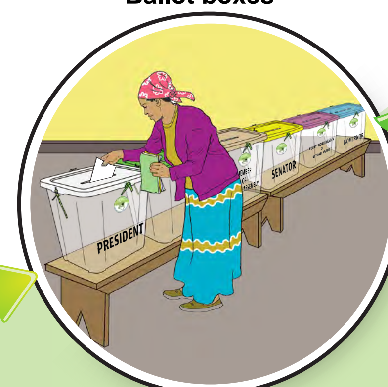
5 Voter cast Ballot Papers in the labeled Ballot boxes