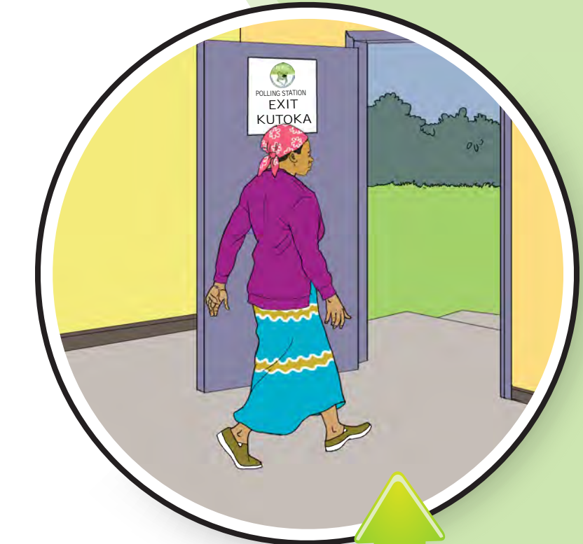
7 Voter leaves Polling Station