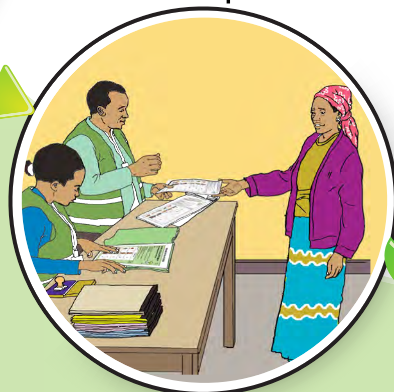
3 Voter is issued with 6 stamped Ballot Papers