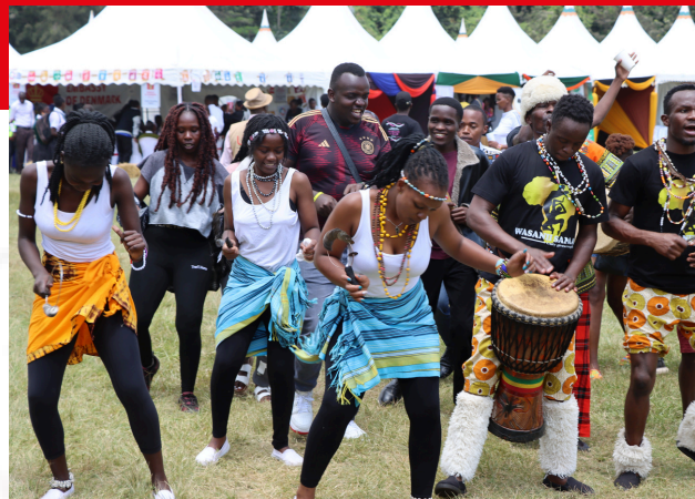
Scenes from the PDF Festivals.

This workshop that drew participation from various actors including those who are not part of the Uraia ecosystem led to the development of a framework on key priority electoral reforms to enhance women's participation in electoral processes. Through this successful activity the department was able to expand an ecosystem for quality gender responsive civic education. The growth is one that shall continue to catalyze a sustainable environment when it comes to Uraia's operations within the gender equality space.