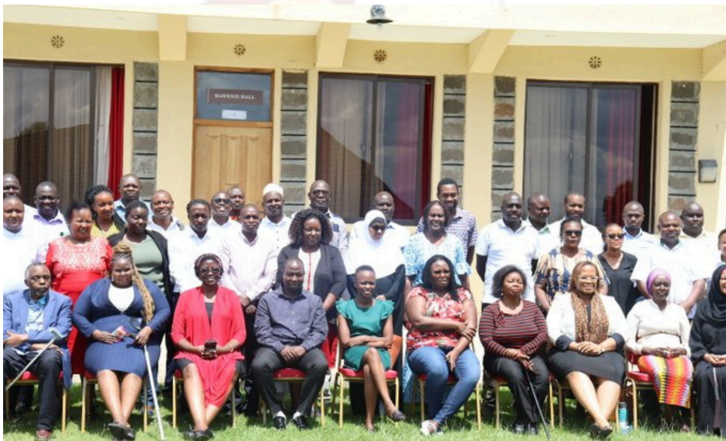
Participants from the Special Interest Group Sector consultative forum with IEBC, Uraia Trust and UNDP.