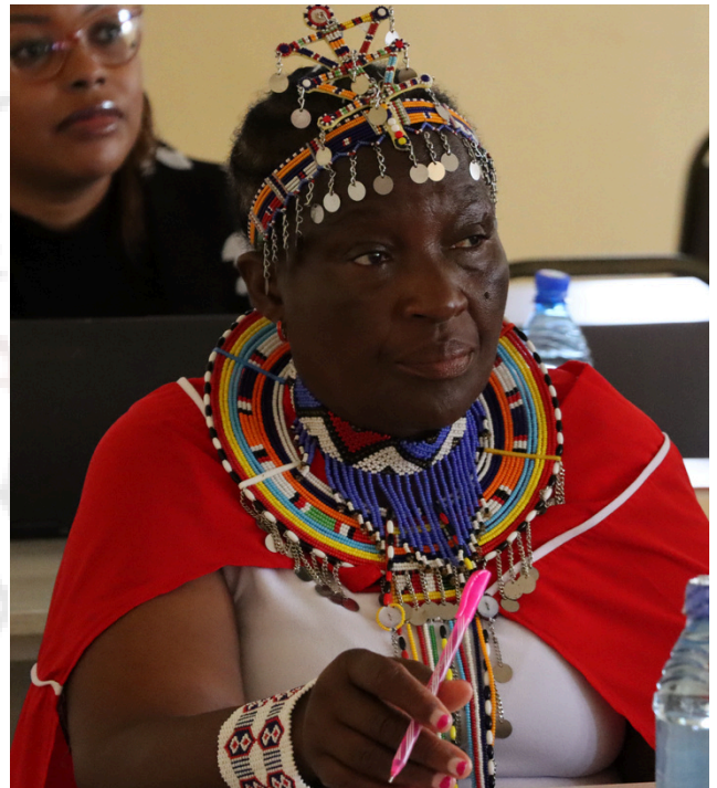
A participant during Gender Responsive Workshop.

Uraia Trust's through the support of UN Women and Global affairs Canada under the project on expanding spaces for women's political participation convened key stakeholders in including the Kajiado County Departmental heads/representatives for meeting aimed at analysing the status quo and addressing gender-responsive budgeting and mainstreaming initiatives at the departmental levels within Kajiado County. The meeting had a focus on increasing awareness of gender-responsive budgeting among participants, developing strategies for mainstreaming gender initiatives within county departments and devising action plans to support women's advancement in both county and national governance.