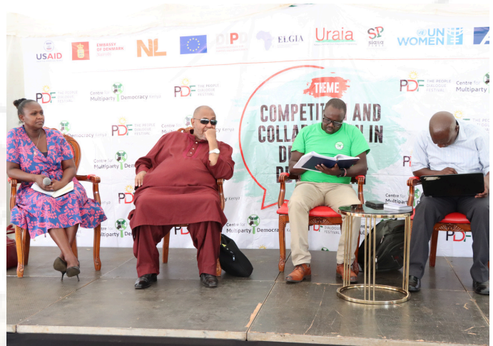
One of the plenary sessions during the PDF festival.