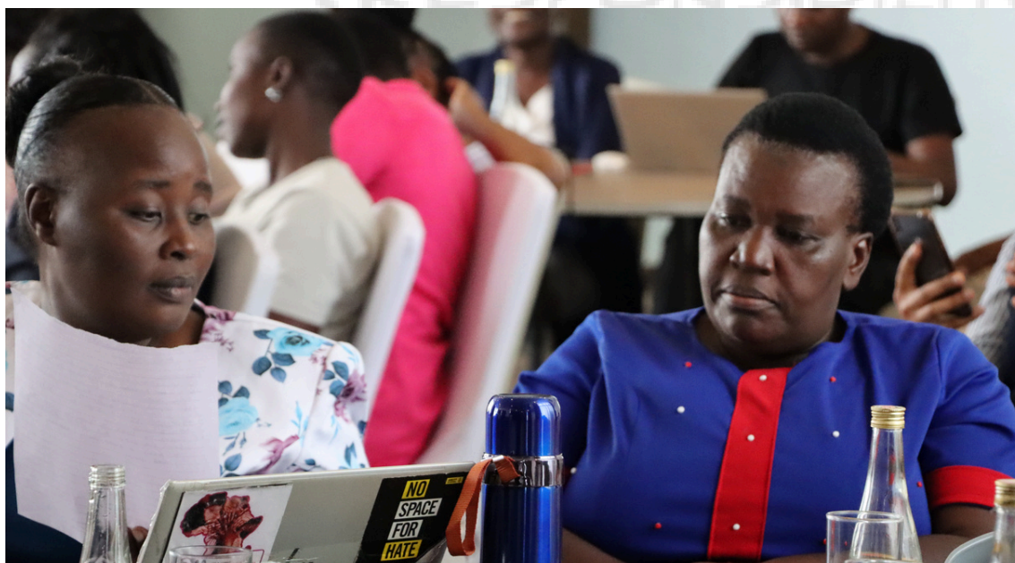
Participants during the National Women Leaders Convention.

The training enhanced knowledge, skills, and abilities of the youth advocates on public budget advocacy.