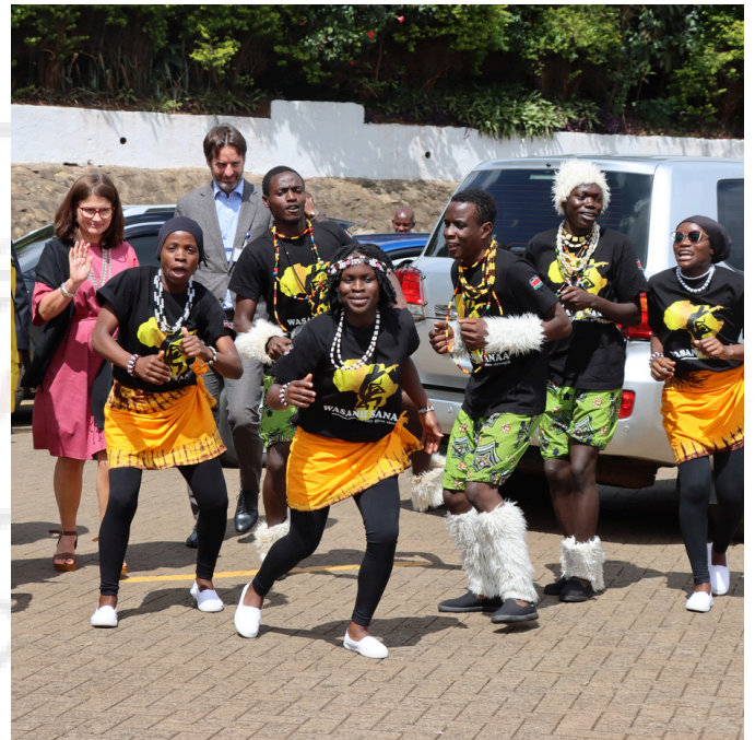
Dancers during the PDF Festival.

Semi Annual Monitoring and Evaluation of Royal Norwegian Embassy consortium members; MWARP, FOLT, PAWA254 AND HAKI YETU under the Rights, Inclusion and Transparency for accountable Institutions (RITAI).