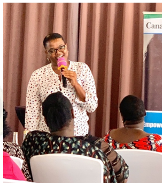
A participant during the National Women Leaders Convention.

The Gender & Inclusion department hosted its first National Women Leaders Convention bringing together elected and nominated women leaders from all the seven (7) UN Women focus counties and other players in the National Women Leadership and equality advocacy space for a two-day intense conference that curated a space for interactions, education, and networking for women leaders from the counties. This convention was hosted in Nairobi. During the conference significant issues were discussed including media and communication branding for the women leaders in preparation for the forthcoming general elections. Leveraging the women caucuses at