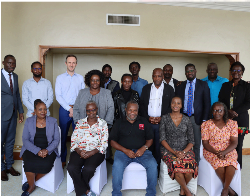
Participants during the Media World Bank roundtable session.