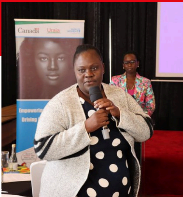
Women leaders in the meeting.