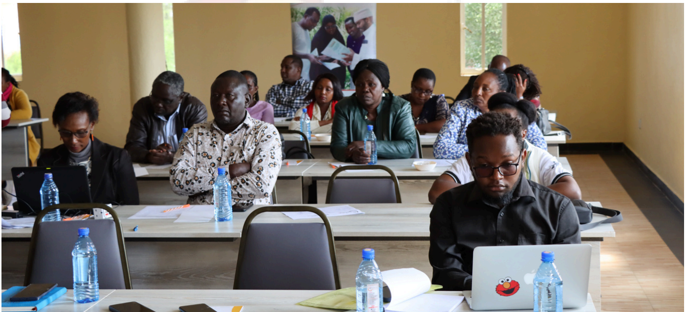
Participants during Gender Responsive Workshop. Credits: Uraia Trust